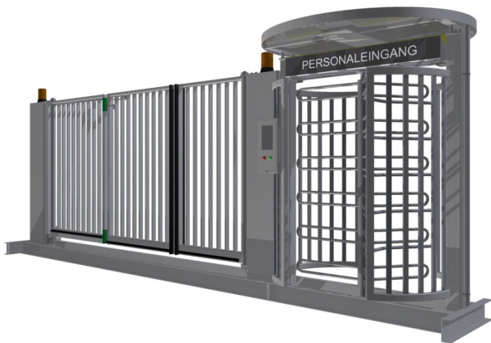
Combination example FFT-Garant 3 + DKR-Rondo 1